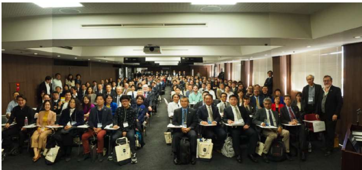
Group Photo from the 3 rd Moon Village Workshop & Symposium (December 2019)

During December 5-8, 2019 the Moon Village Association organized the third Workshop & Symposium, which was held in Tokyo & Kyoto, Japan, in cooperation with Tokyo University of Science, Kyoto University, and Keio University Institute of Space Law. The third workshop & symposium had over 250 participants from across Japan and the world. See below for a “group photo” from the meeting.