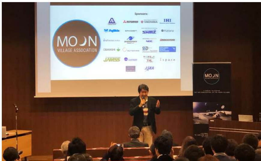
Opening Remarks at the Kyoto Session (December 8, 2019)