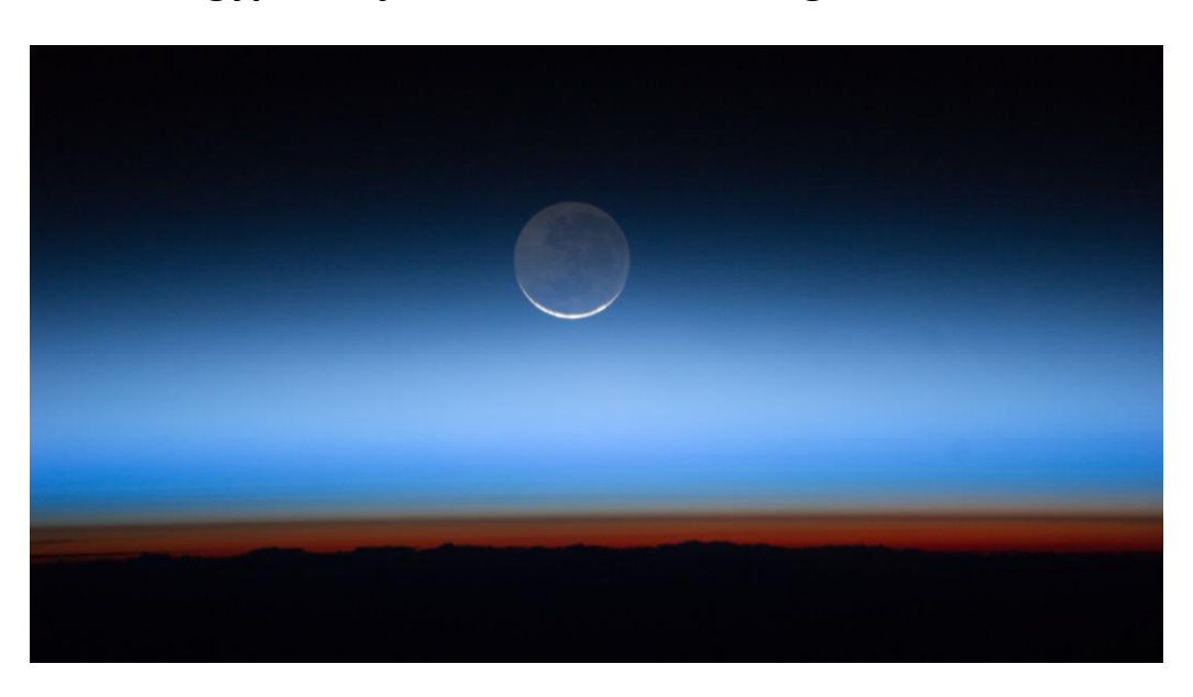
Vienna, Austria - (December 21, 2020) –

Egyptian Space Agency Joined the Moon Village Association (MVA) to further participate in the development of various projects aiming at moon exploration.